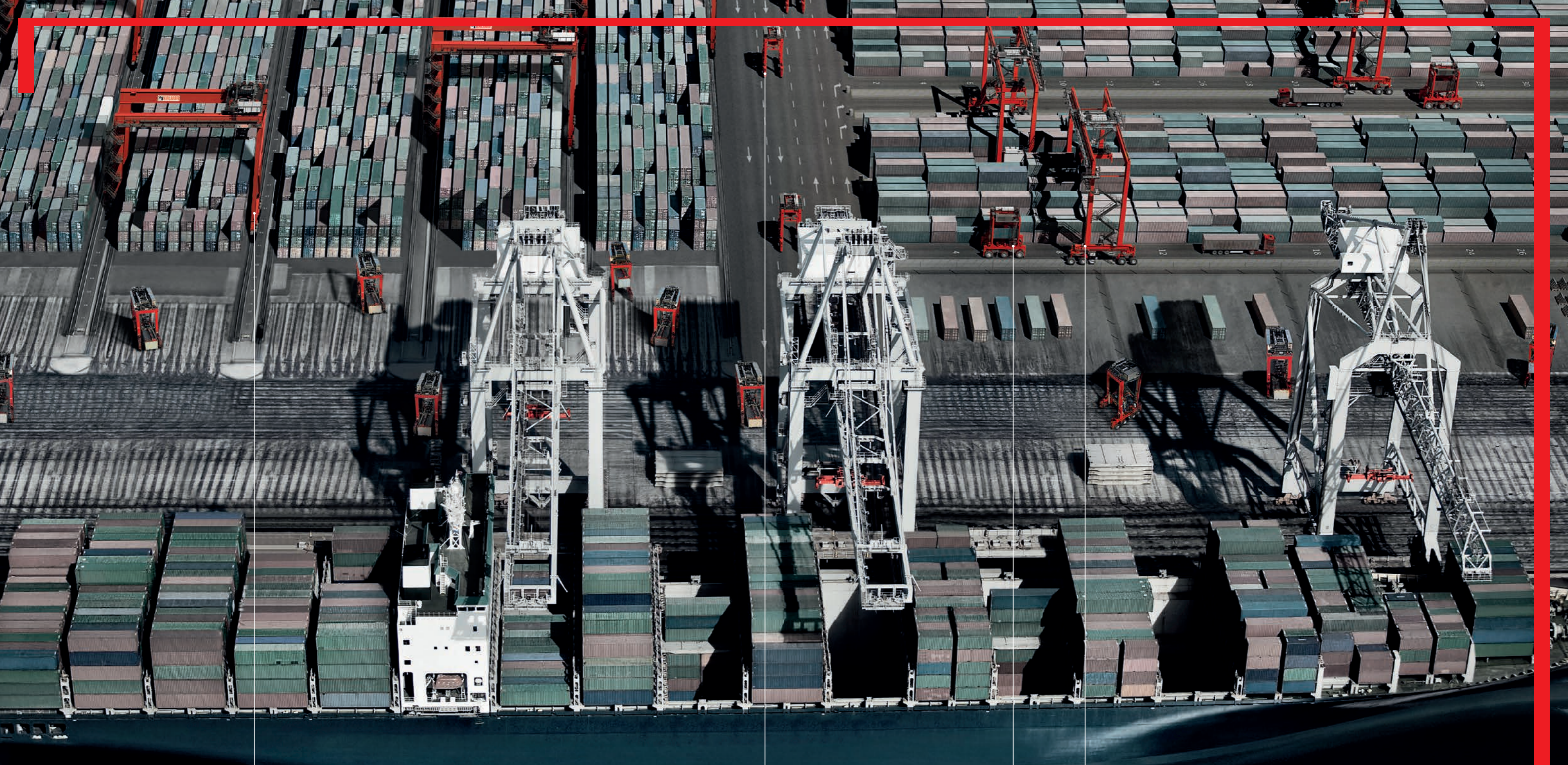
Automatic Stacking Crane