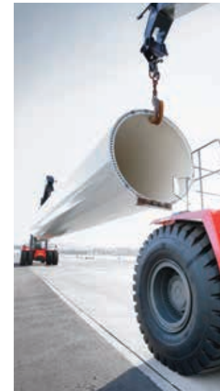
Industrial Handling - Lift Hook (Z)