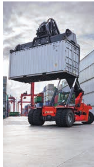
Container Handling - Top Lift (S)

There are a range of attachments that can be fitted onto your reachstacker, which one depends of your handling needs.