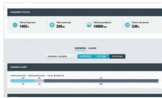
Plan your maintenance and spare parts needs.