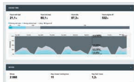
View each machine's movements as they occur.