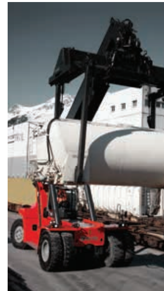
Intermodal Handling - Top Lift and Trailer Lift (C)