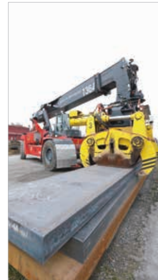
Industrial Handling - Tool Carrier (A)