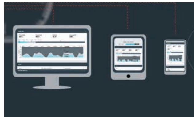
Access on mobile, tablet or traditional screen.

Kalmar Insight* comes fitted in all new Kalmar machines and can be retrofitted to existing Kalmar machines or those built by other manufacturers. Kalmar Insight is included when the Eco Reachstacker is chosen with a Fuel Savings Guarantee.