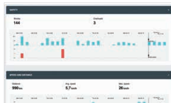
View each operator's performance in real time.